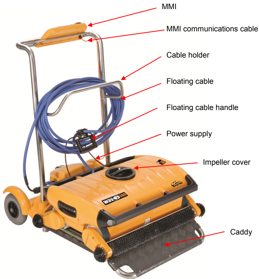
MMI communications cable